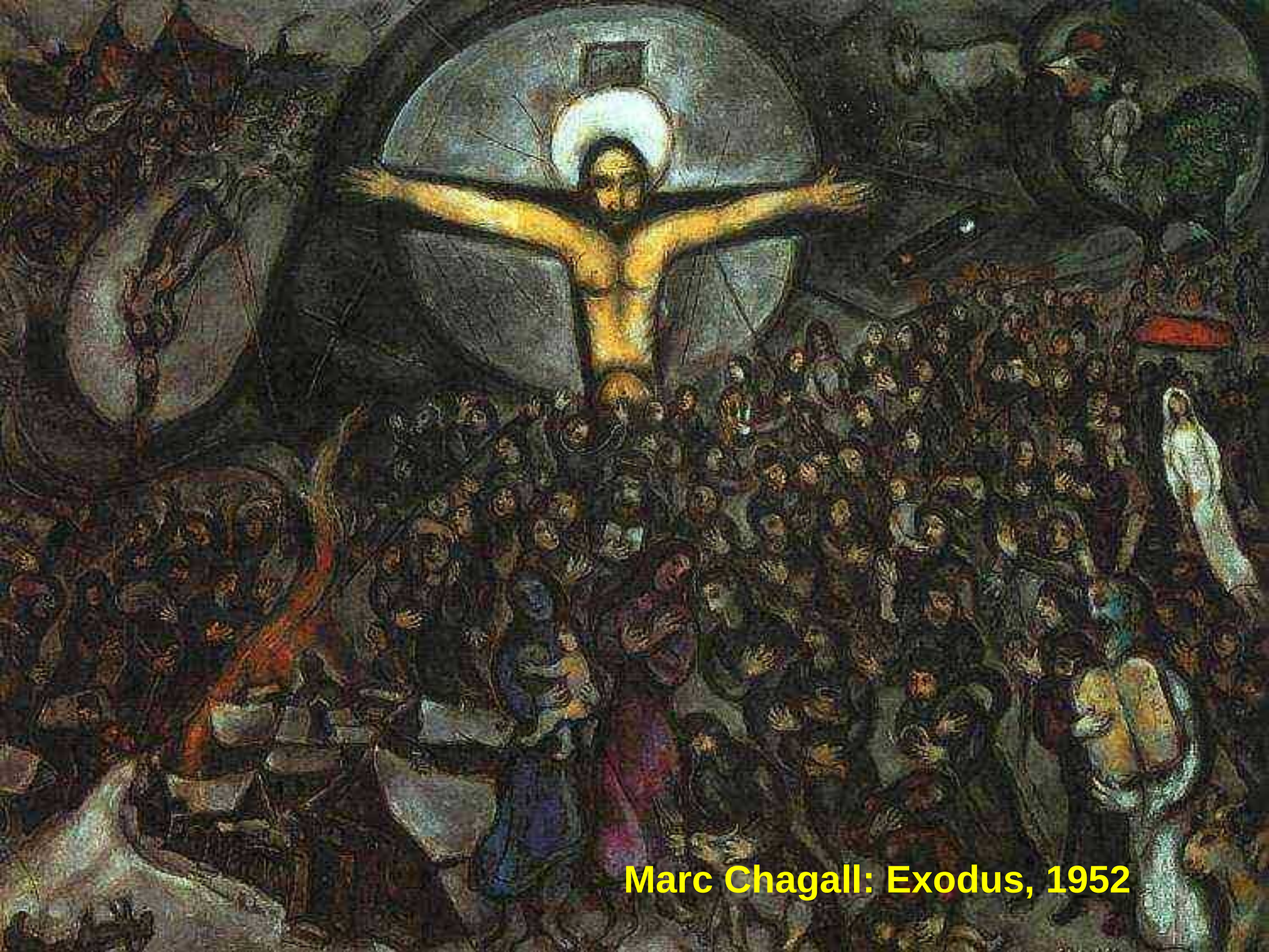
Marc Chagall: Exodus, 1952