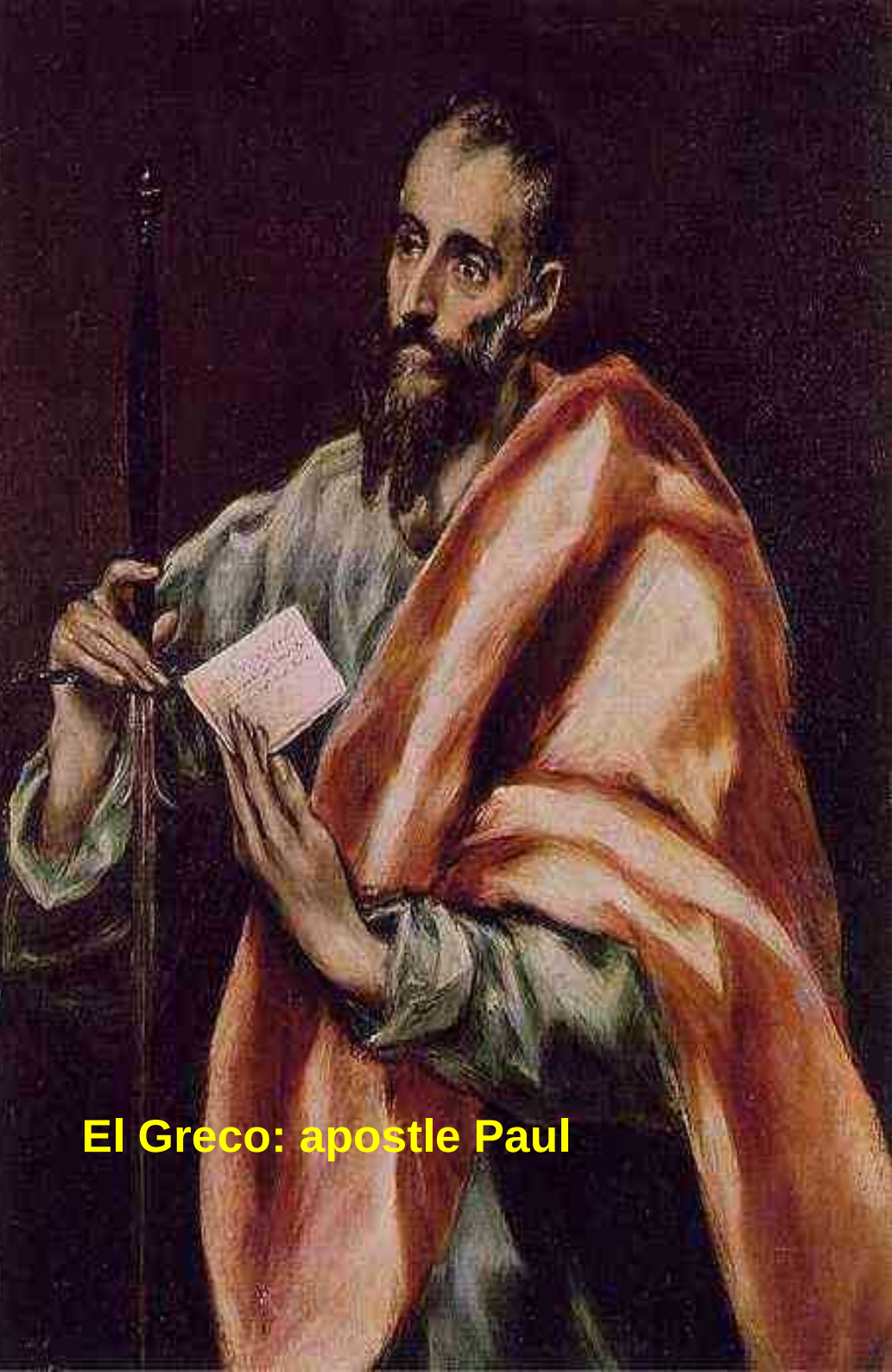
El Greco: apostle Paul