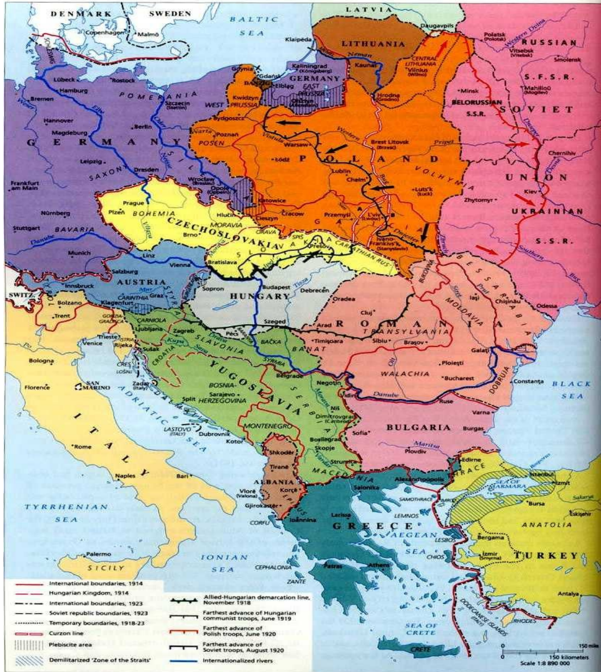
Historical Atlas of East Central Europe